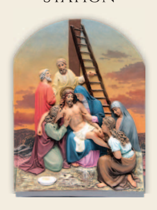
We do not strive for spectacular actions. What counts is the gift of yourself, the degree of love you put into each of your deeds.