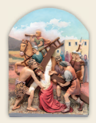
Don't worry about why problems exist in the world—just respond to people's needs.