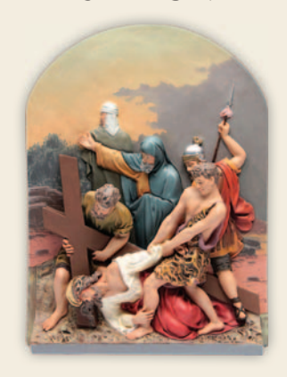
You may be exhausted with work, but unless your work is interwoven with love, it is useless. To work without love is slavery.