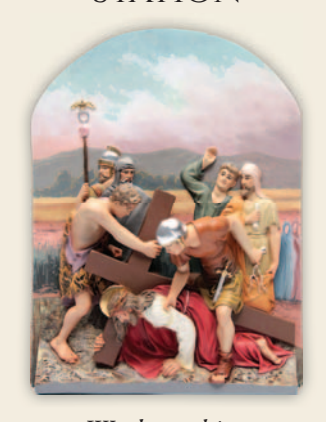
We do nothing. He does everything. All glory must be returned to him. God has not called us to be successful. He called me to be faithful.